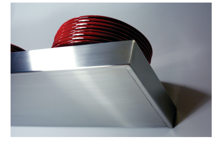
Standard (overlapping bottm seam) The underside has a visible seam that can only be seen from underneath